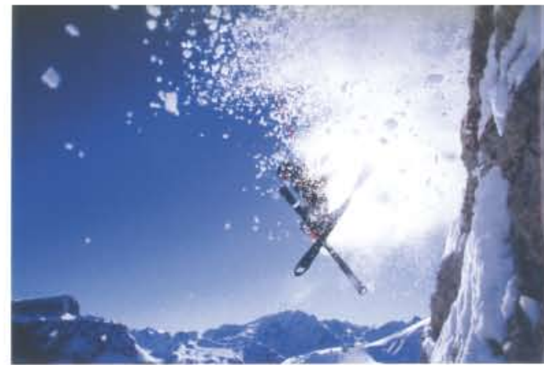
Above: The Dolomites are this year's hot skiing destination.