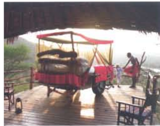
Above: Sleep under the stars in a Koija Star Bed in Laikipia, Kenya. Below: North Korea beckons with Steppes Travel's escorted 16-day trip.

For an alternative thrill, go open-top and head south with the upcoming spring. Red Travel ( www.red-travel.com ) provides a top-of-the-range Ferrari, escort car and custom-