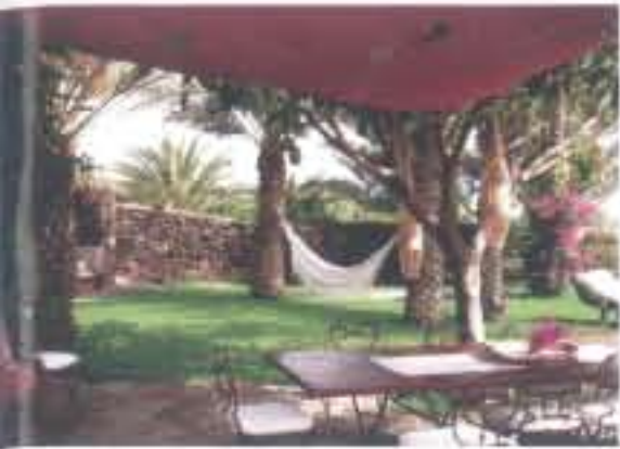
Above: The super-chic villa Casa N in Pantelleria, Italy. Below: Imam Mosque in Isfahan, Iran, where Wild Frontiers soon ventures for the first time.