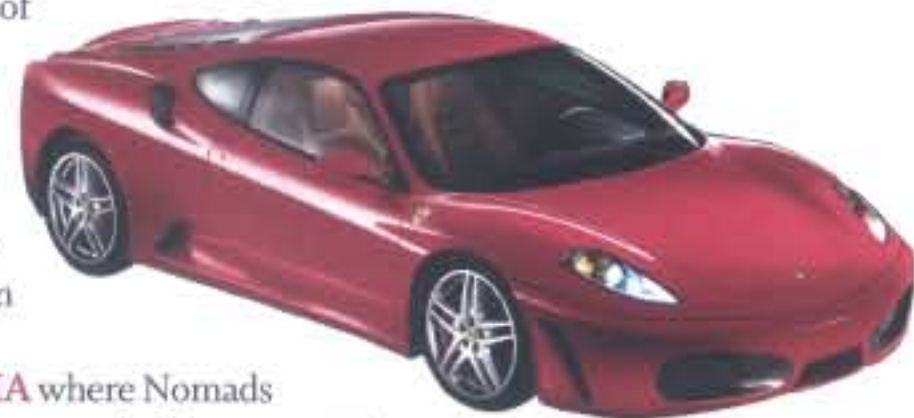
Above: Red Travel tailor-makes itineraries in Italy for clients wanting to drive one of its top Ferraris, such as this F430 £1.