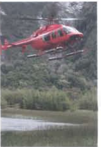
Above: Haute luxury meets high adventure on Nomads of the Seas' Patagonia trip.