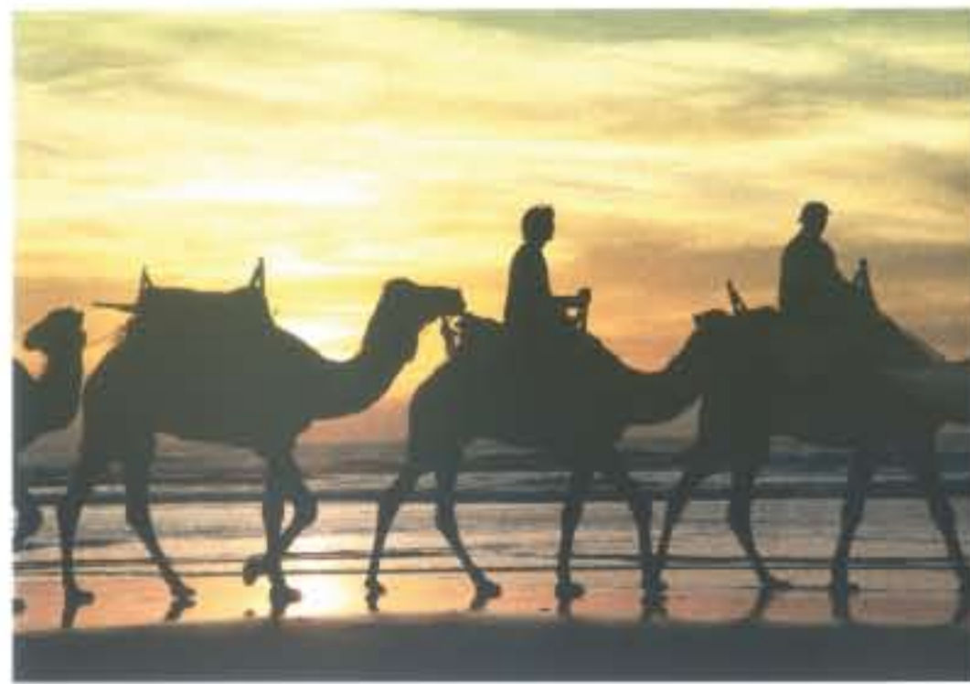
Camel riding on the beach at Essaouira, where the new Riad Lotus O Marine is located.

For those who prefer to get their kicks from skiing, all talk is of the DOLOMITES – one of Italy's better-